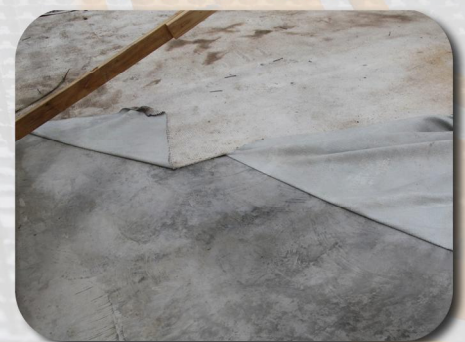
Increases MPA strength by over 30%