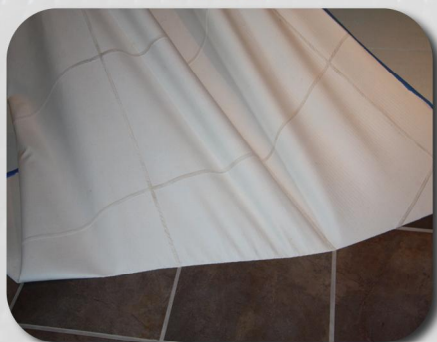
Skudo cleans the grout as it is removed.